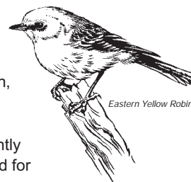
Eastern Yellow Robin

The canopy of tall eucalypts provides food and nesting areas for a variety of birds including honeyeaters. The understorey composed of tall shrubs and small trees is home to the Eastern Yellow Robin, often seen perching sideways on low branches, eyes intently searching the ground for food.