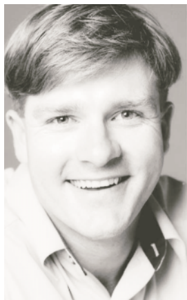
Parks Victoria Ranger

A bird watchers paradise, the parks can be explored from the shore or by boat. The parks are reached from the South Gippsland Highway via Port Welshpool, Port Albert, McLoughlins Beach or Yanakie.